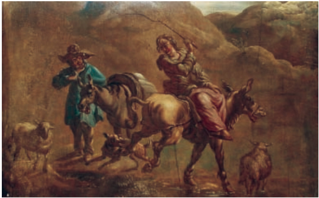
Note: These illustrations are details taken from a cycle of early nineteenth-century Italianate landscape mural paintings which completely cover the walls, from the dado upwards, in the original Senate rooms on the first floor of No. 49 Merrion Square.