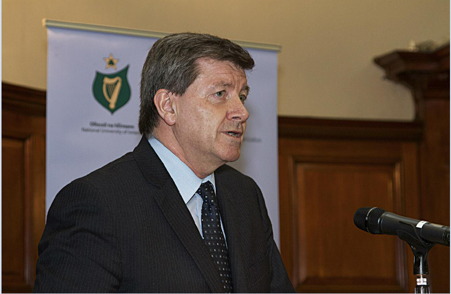
Guy Ryder responding to President Higgins' lecture.