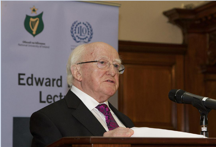
His Excellency President Michael D. Higgins gives his lecture.